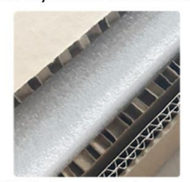
PP Cotton + Thickened Honeycomb Cardboard