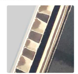
High-Strength Thickened Corner Protector