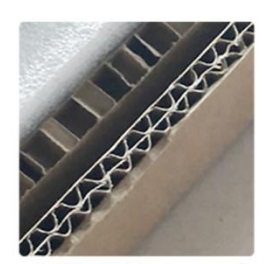
3CM Thickened Honeycomb Cardboard